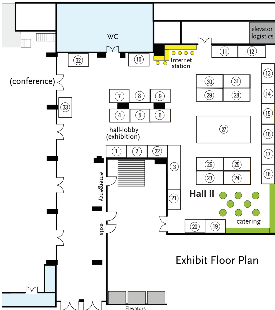
Exhibit Floor Plan